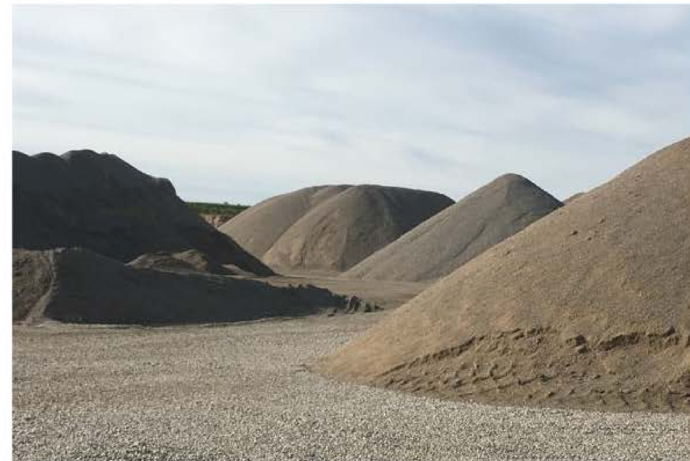
STOCKPILES OF VARIOUS PRODUCTS READY FOR SHIPPING