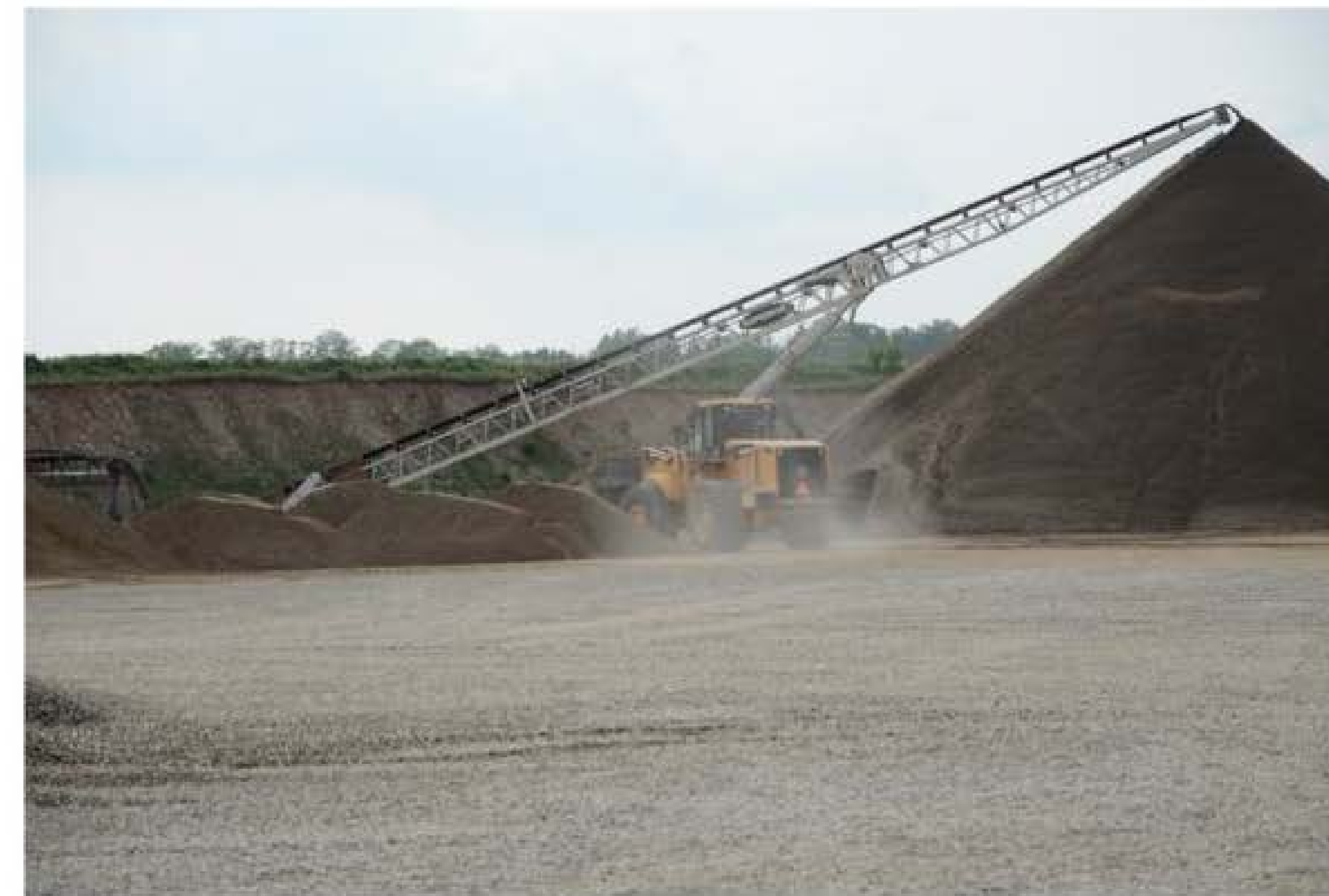
PROCESSING AREA IN EXISTING PIT