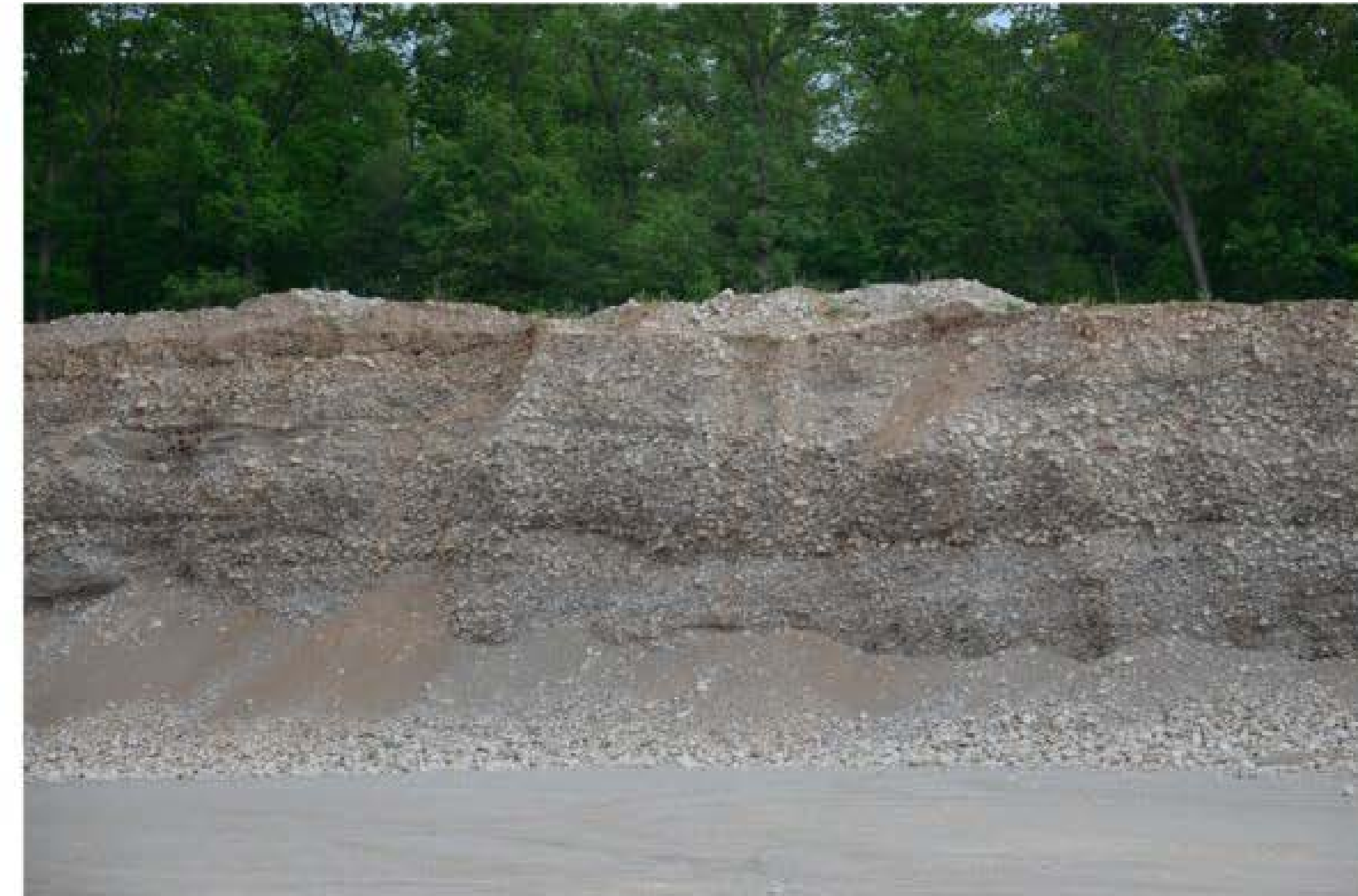
EXISTING PIT FACE OF HIGH QUALITY SAND AND GRAVEL