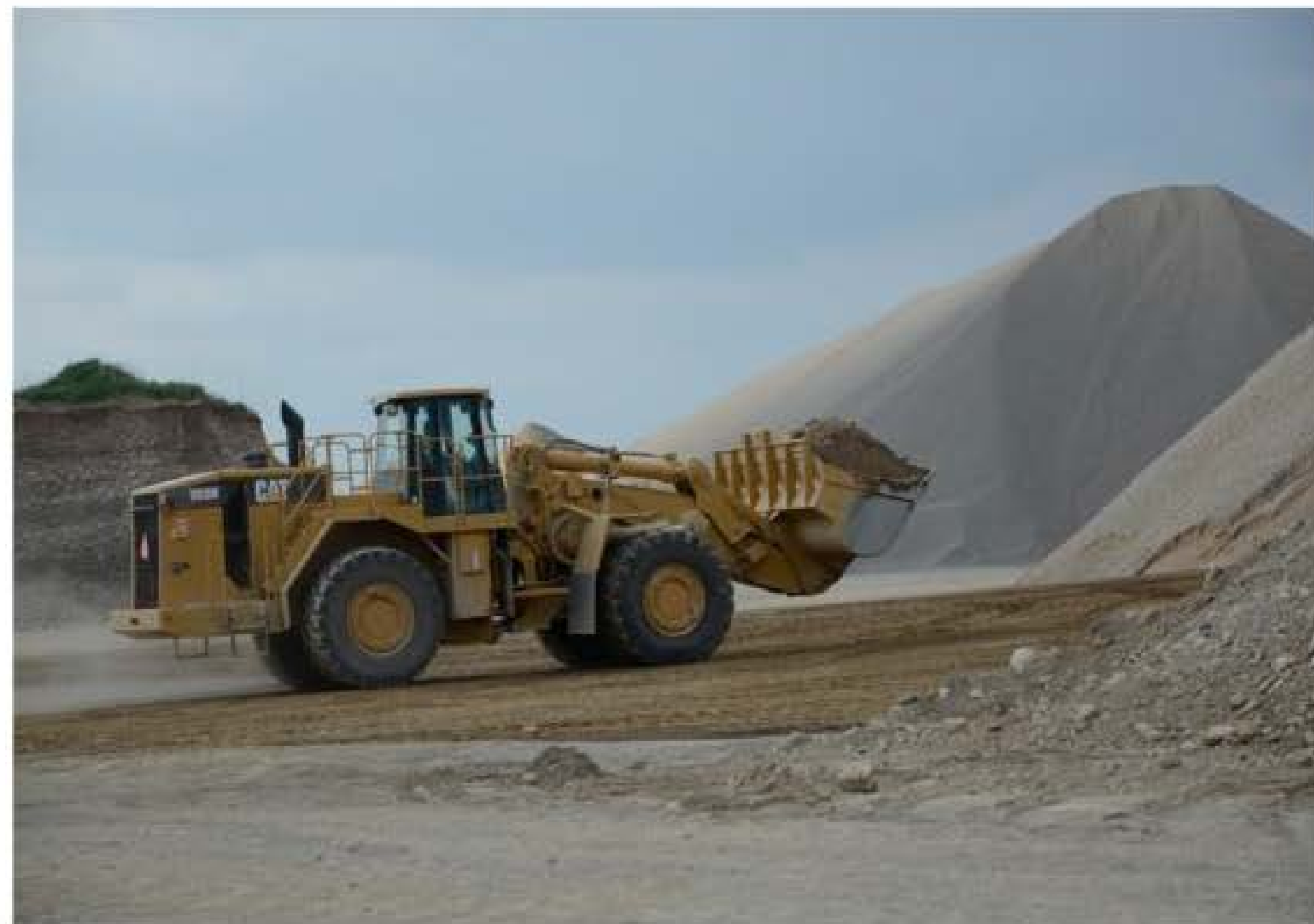
PROCESSED AGGREGATE READY FOR LOADING ON TRUCKS AT EXISTING PIT