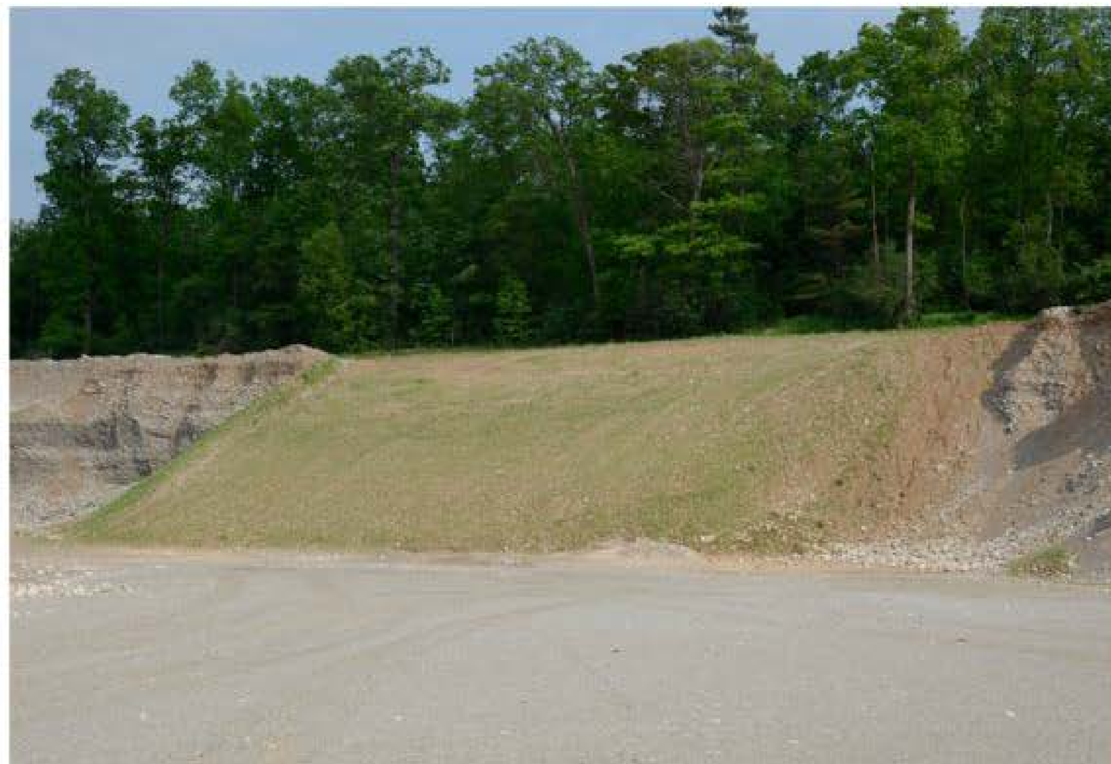
PROGRESSIVE REHABILITATION OF SIDE SLOPES