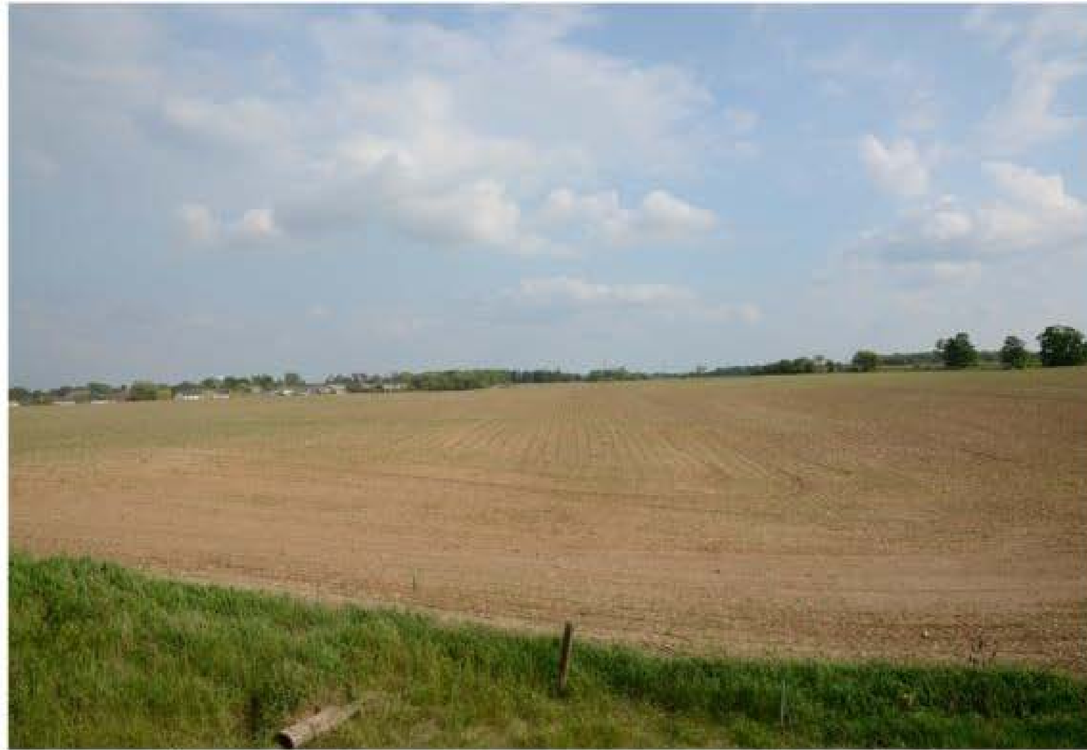
EXISTING FARM FIELD - CASH CROPS