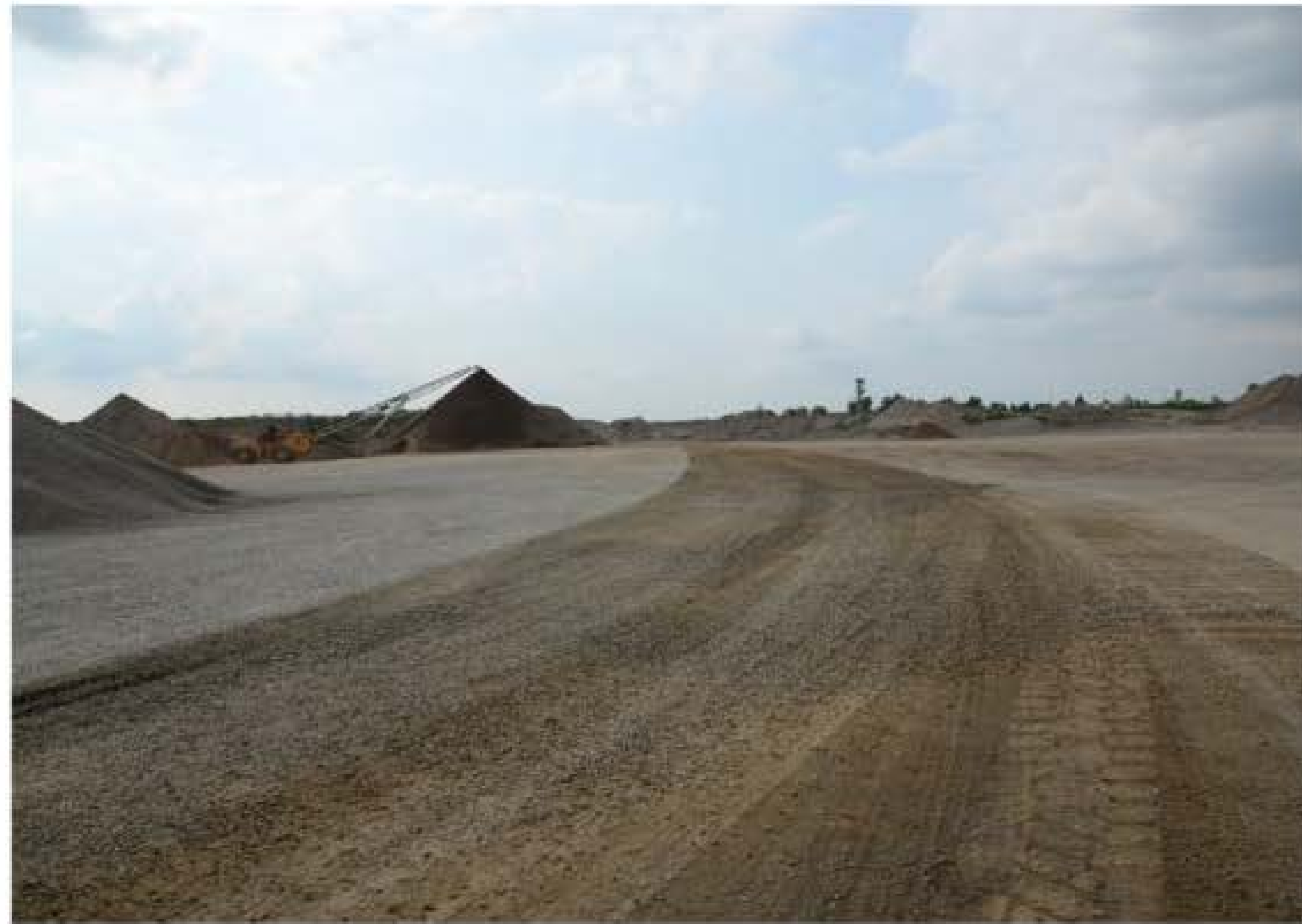
HAUL ROAD IN EXISTING PIT TREATED WITH DUST SUPPRESSANT