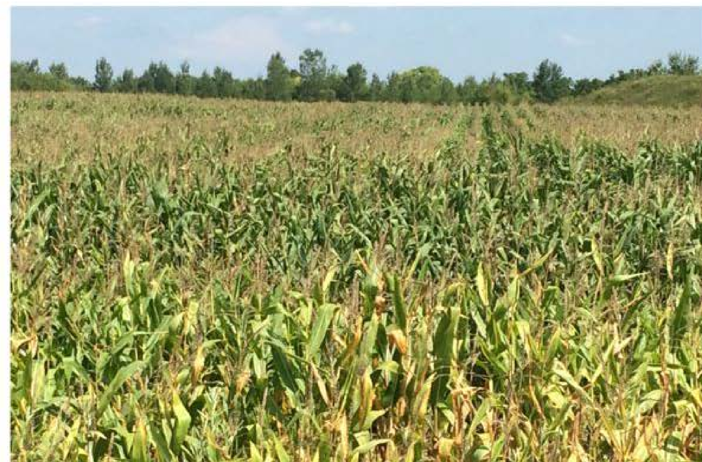
RETURN TO AGRICULTURE POST EXTRACTION